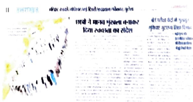
Drive On the Occasion of World Environment Day

Coordinator-IQAC B. L. J. Govt. Post Graduate College Purola, (Uttarkashi)