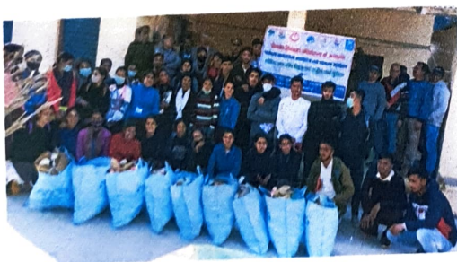
Environment Awareness Campaign and Cleanliness