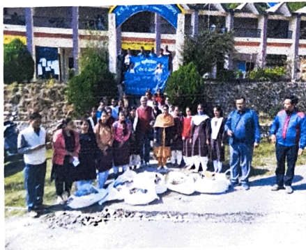
Cleanliness Drive by NSS Unit