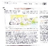
Cleanliness Drive during NSS Camp along with an Awareness Rally