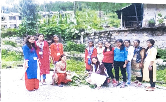
Cleanliness Drive within College Campus On the Occasion of Gandhi Jayanti