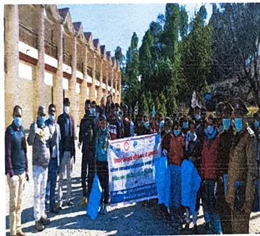
Cleanliness Drive in Collaboration with Forest Department