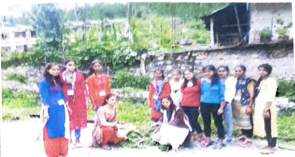
Cleanliness Drive within College Campus On the Occasion of Gandhi Jayanti