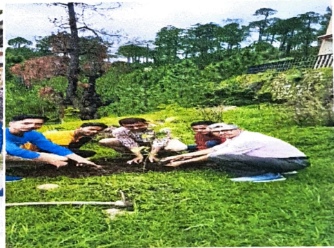
Plantation within College Premises